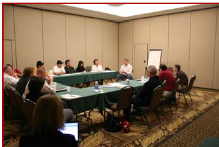
Summit Breakout Discussion

A primary Summit objective was to provide participants with a forum to share their experiences, learn from one another, and work together to begin identifying future directions. To achieve this, Summit participants were divided into breakout groups around specific discussion topics. On the first day, participants attended small group, multidisciplinary sessions focused on data. For the day-two sessions, participants were divided into three topic areas: engineering, enforcement/EMS, and education. The discussions on both days focused on: 1) what is current practice; 2) what are the gaps and obstacles; and 3) what can we do to move forward? The following highlights from each breakout session were presented to the full Summit (a detailed collection of participant comments from the breakout sessions is available in Appendix C).